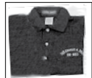
Item #2 Embroidered Golf Type shirts (with pocket) Ships Crest and Name Navy Blue SM to 1X - $32.00 2X and 3X - $33.00